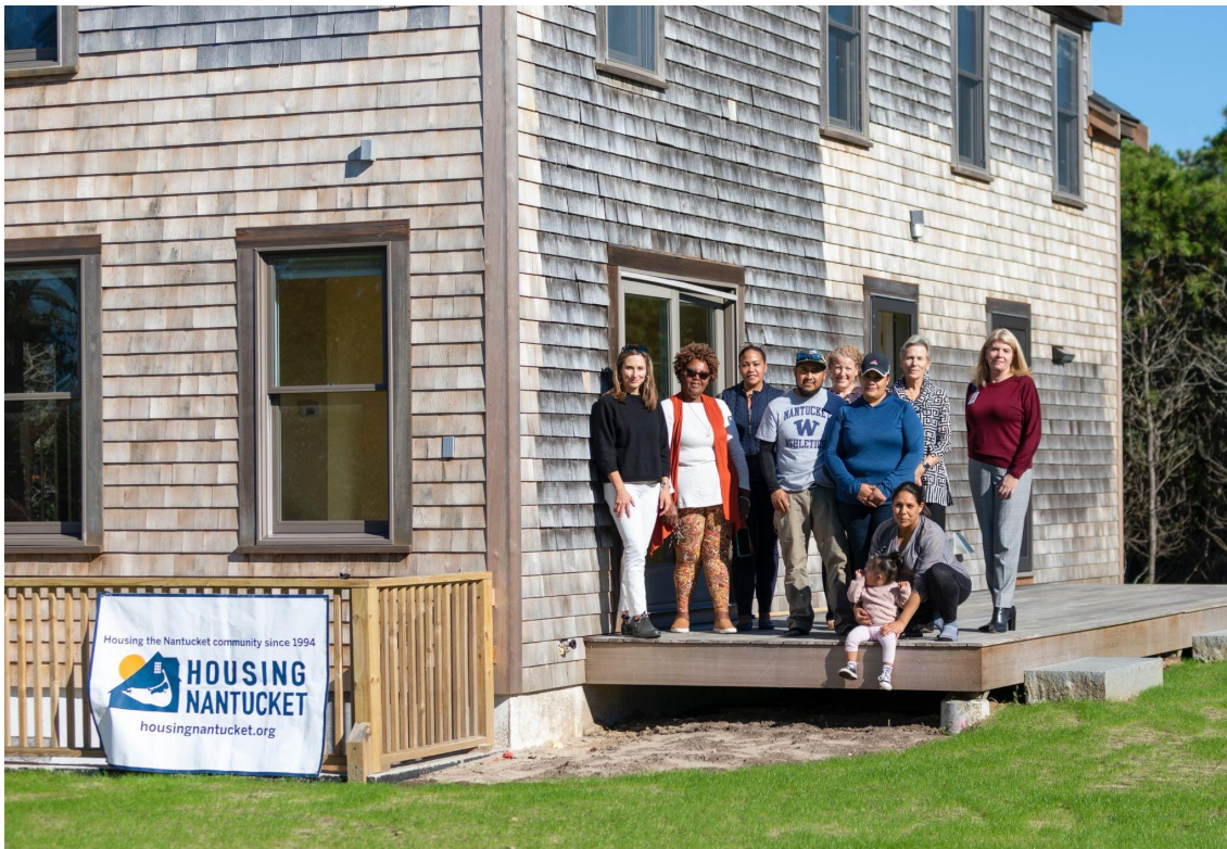
Figure 3- Ribbon Cutting at 46 Okorwaw Avenue

Sustaining tenant relationships continues to be a high priority for us, as feedback from our constituents informs our nonprofit's activities. Through face-to-face interactions and telephone contact, we become aware of emerging issues and can assist in alleviating hardship at an early stage. These conversations inform our partnerships with our funders. Gifts from the Tupancy Harris Foundation, ReMain Nantucket, and the Community Foundation for Nantucket (CFN) have all played an important role as we address the systemic issues associated with the affordable housing crisis on Nantucket. The insights reported by our constituency base have proved to be invaluable as we direct funding from these organizations.