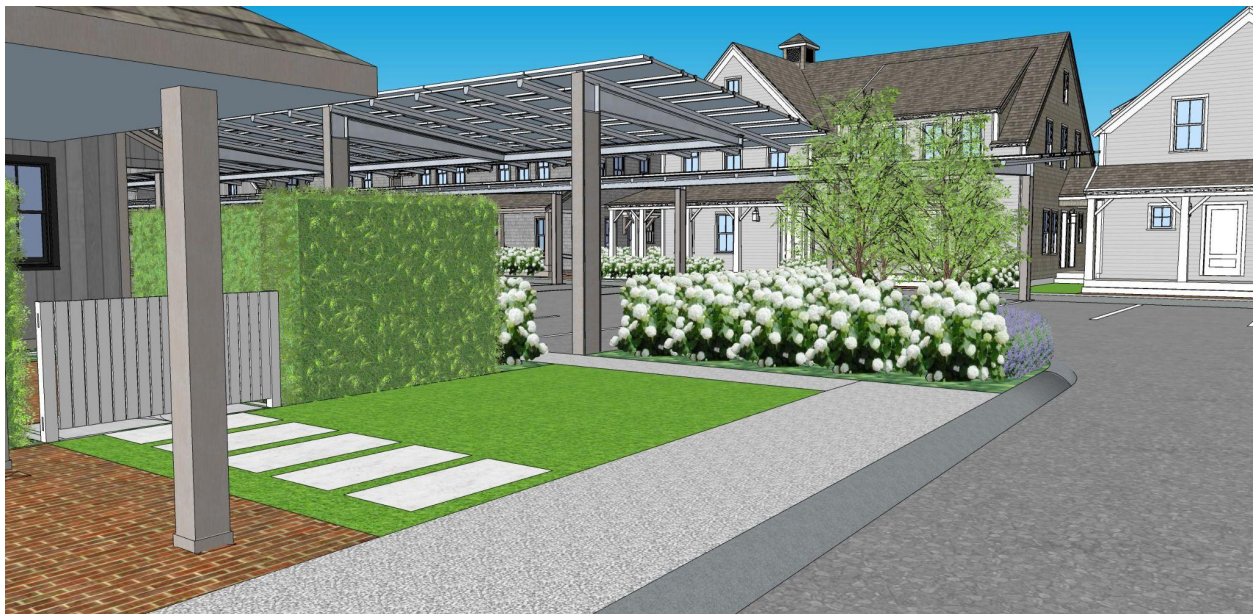
Figure 4 - Solar rendering for Wiggles Way

Housing Nantucket’s Community Investment Plan facilitates the Commonwealth’s stated commitment to provide a range of housing choices for a variety of income and demographic needs. Using this plan as a guide, residents of this rural Massachusetts community can work together to improve economic opportunities for low and moderate income households, creating lasting change that will be felt for generations.