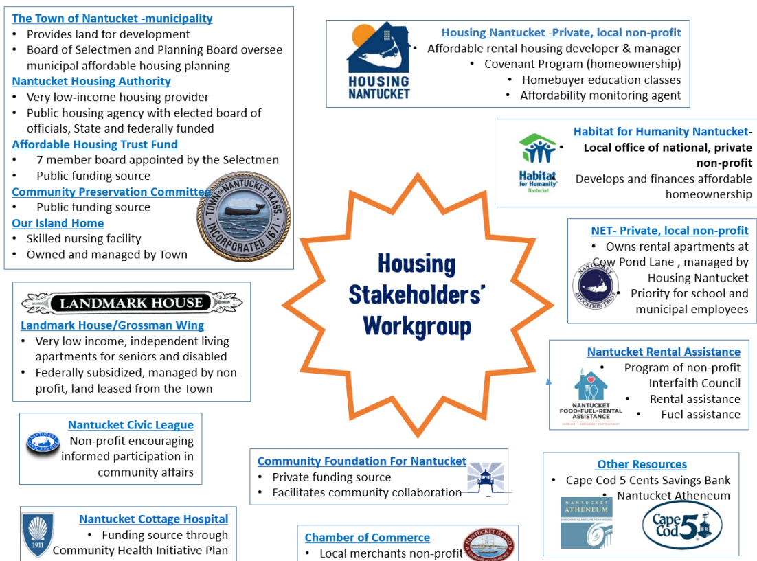
Figure 1 – Housing Nantucket’s Housing Stakeholders’ Workgroup

Several organizations contribute towards addressing Nantucket’s ongoing housing needs, and each entity has a specific focus. Effective use of our combined resources requires close collaboration and cooperation among advocates. Housing Nantucket hosts a monthly meeting of these entities, known as the Housing Stakeholders Workgroup (Figure 1). The purpose of the group is to keep each other abreast of our individual efforts, as well as encourage, identify, endorse, and implement strategies collectively deemed worthy of pursuit.