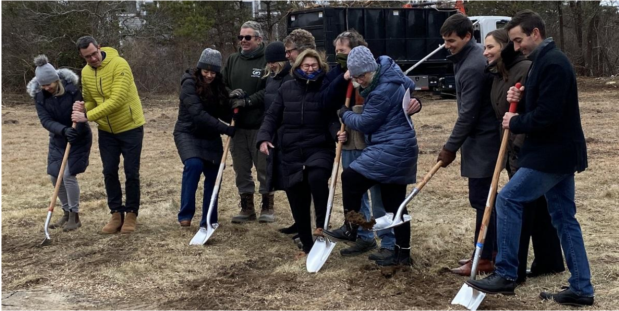
Figure 2- Groundbreaking at 31 Fairgrounds Road

In addition to our Wiggles Way development, Housing Nantucket created an additional single family rental unit through our House Recycling program with financial support from the Affordable Housing Trust as well as a grant through Nantucket Hospital’s Community Health Initiative.